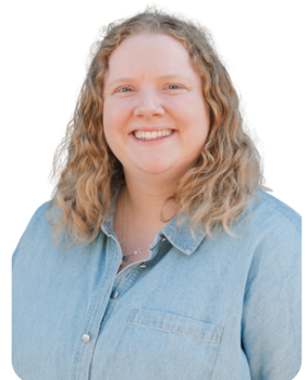
Mt Barker / Verdun Pastoral Resident