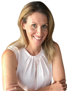
Aldgate Associate Pastor