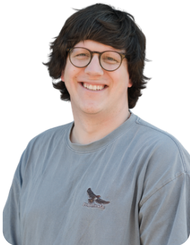
Mt Barker / Verdun Campus Pastor