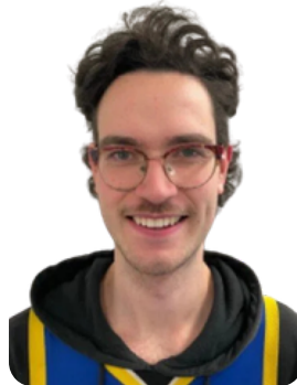
Aldgate Young Adults Pastor